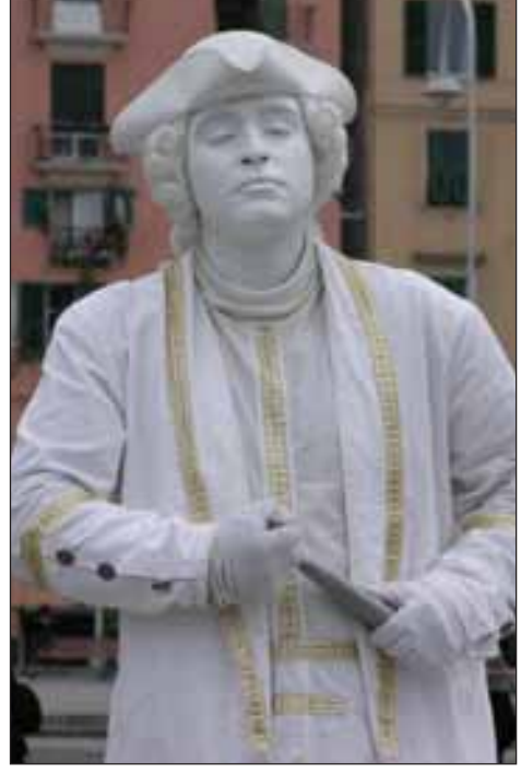
Christopher Columbus impersonator in Genoa.